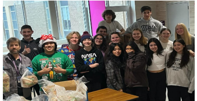
Students prepared food for The Sandwich Project at BLAST Day 2023.

Southwest's 'Be Loving And Sharing Together Day' occurred the Friday before winter break. The tradition is a time where students and staff participate in service-based learning as they give back to our greater community. Students totaled 1,386 volunteer hours for more than 10 local non-profit organizations.