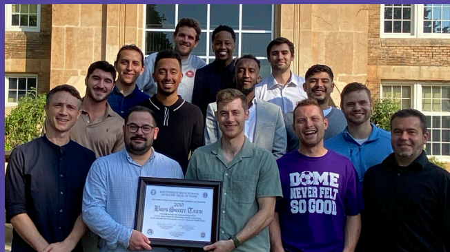
The 2010 Boys Soccer Team return to Southwest for the HOF event.

This year's SW Athletic HOF induction event was held before a large gathering of alumni, students, faculty and community members in the SW auditorium on September 30, 2023.