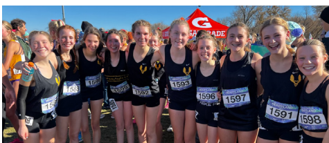
Conference Champion Girls Cross Country team!