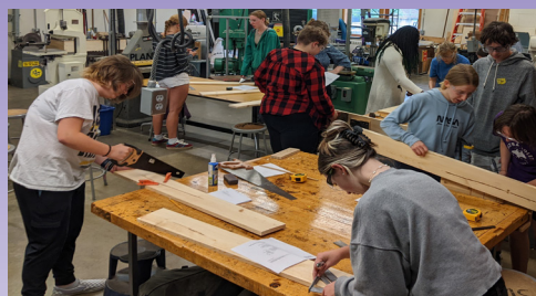
Girls in the Shop students measuring and cutting lumber for their birdhouse construction project.

According to the American Association of University Women, only about 34% of the STEM workforce is female-identifying, and only about 16% of the engineering and architecture workforce is such. There is a gender gap between men and non-men in the field of STEM, both in and out of school and the workplace, and some of the students at Southwest have taken the initiative to make a difference.