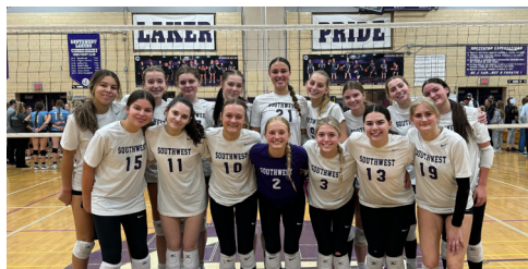
Girls Volleyball had another playoff season.